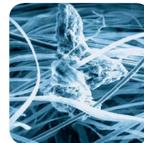
Dirt captured in the microscopic fibre network