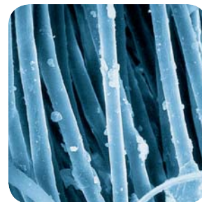
Tiny dust particles caught on fiber surfaces