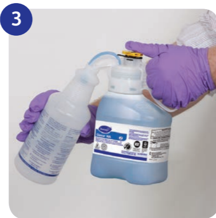
3 Push the knob down fully to pump a precise dose of concentrate needed for the correct dilution when mixed with water.