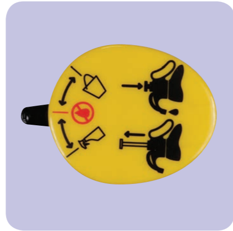
Control knob with easy-to-understand icons.