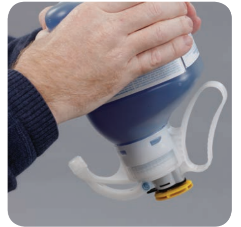
Patented Spill-Tite™ sonically-welded head eliminates leaking of concentrate.