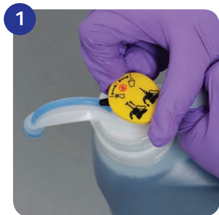
1 Turn the control knob to select the appropriate icon.