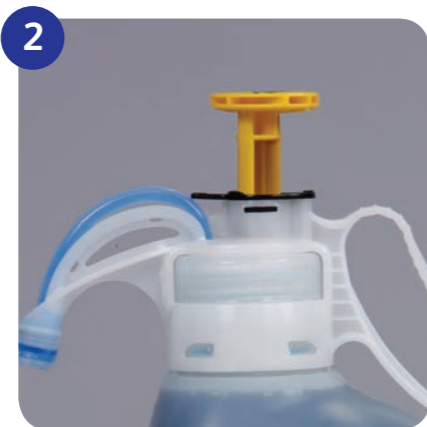
2 Pull up on control knob one time to prime the pump.