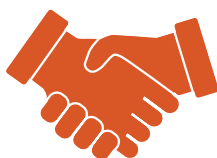
Person to person transmission