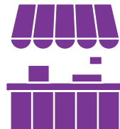
Visiting seafood market, contact with live or dead animals