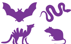
Bats and game animals