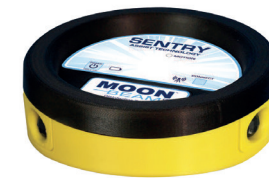
Optional Sentry Assist Technology provides full zone motion detection for optimal personnel safety.

Remote Cover controls unit operation and acts as a sensing and guarding point during disinfection to ensure safety.