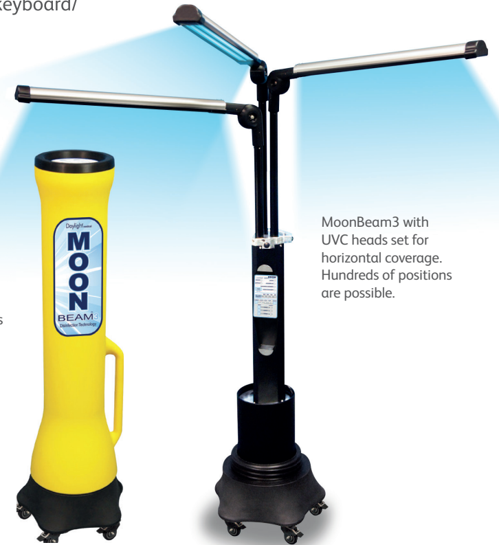
MoonBeam3 with UVC heads set for horizontal coverage. Hundreds of positions are possible.

Remote Cover controls unit operation and acts as a sensing and guarding point during disinfection to ensure safety.